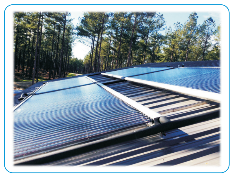
Dairy farm, Olar SC, USA

A German-made vacuum tube collector with a patented internal overheat protection