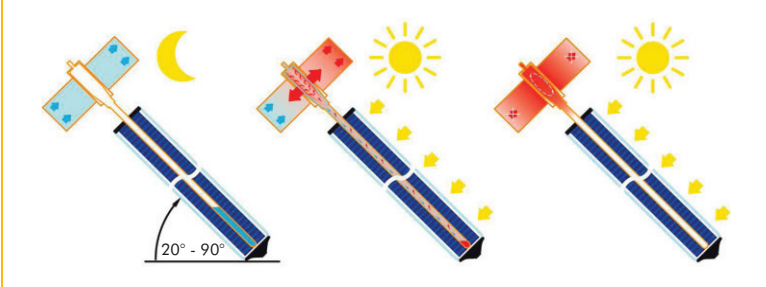
Standby / night In operation