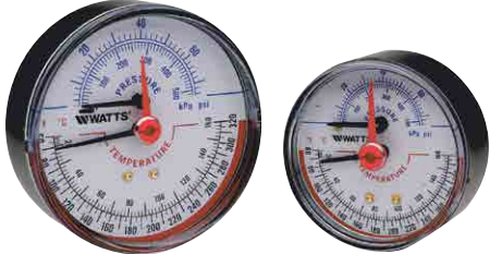
3" (80 mm) Dial LFDPTG3 2 1/2" (65 mm) Dial

Working Temperature: 60°F – 320°F (20°C – 160°C)